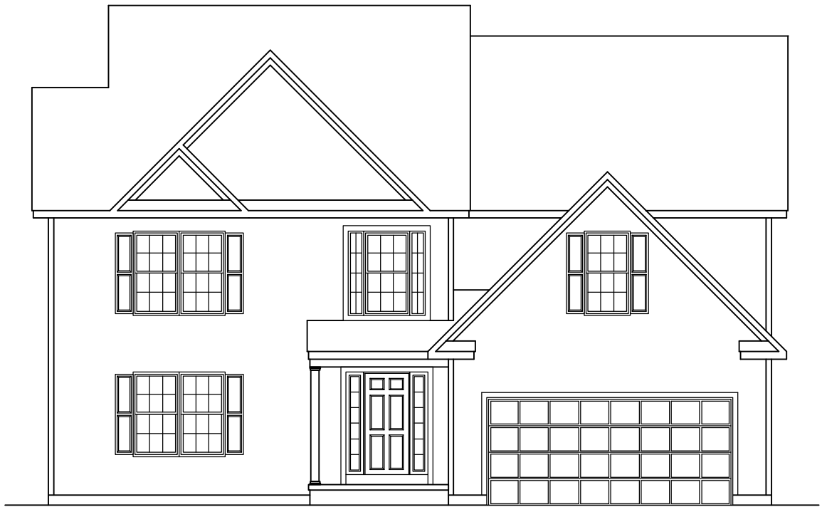
FRONT ELEVATION CAMBRIDGE