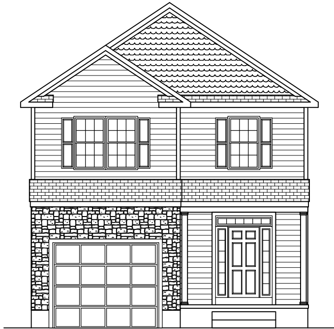
FRONT ELEVATION POWHATAN